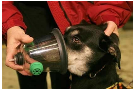
(Putnam Emergency Animal Response Team)

Putnam County is starting a Community Animal Response Team and is looking for interested volunteers. Primarily, we are looking for: